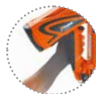
Best balance tool