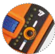
Fuel & battery gauge