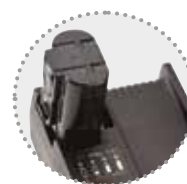
Quick charge, long life lithium battery