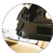
Fast hole locator probe