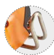
Rafter / belt hook