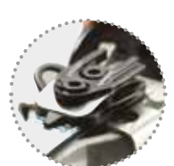
Pinch and slide depth of drive