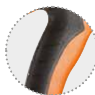
Soft grip handle